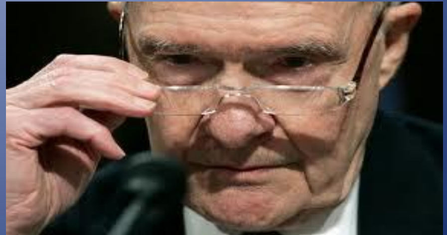
Brent Scowcroft (April 2012)